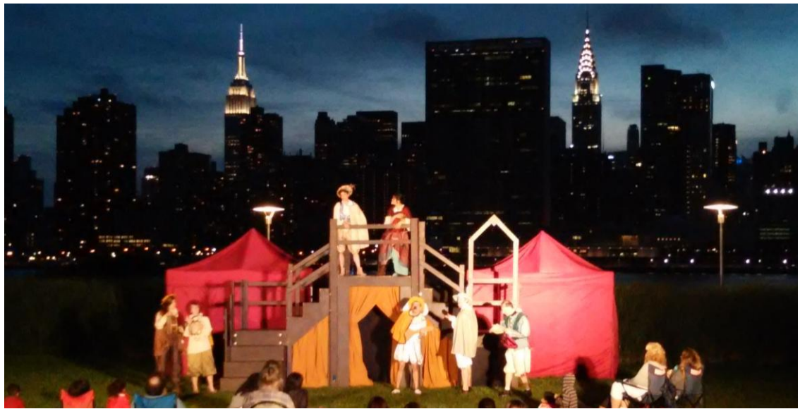
Two Gentlemen of Verona at Gantry Plaza State Park, 2014

Phone: 718-729-8567 Email: contact@hiptohip.org www.hiptohip.org