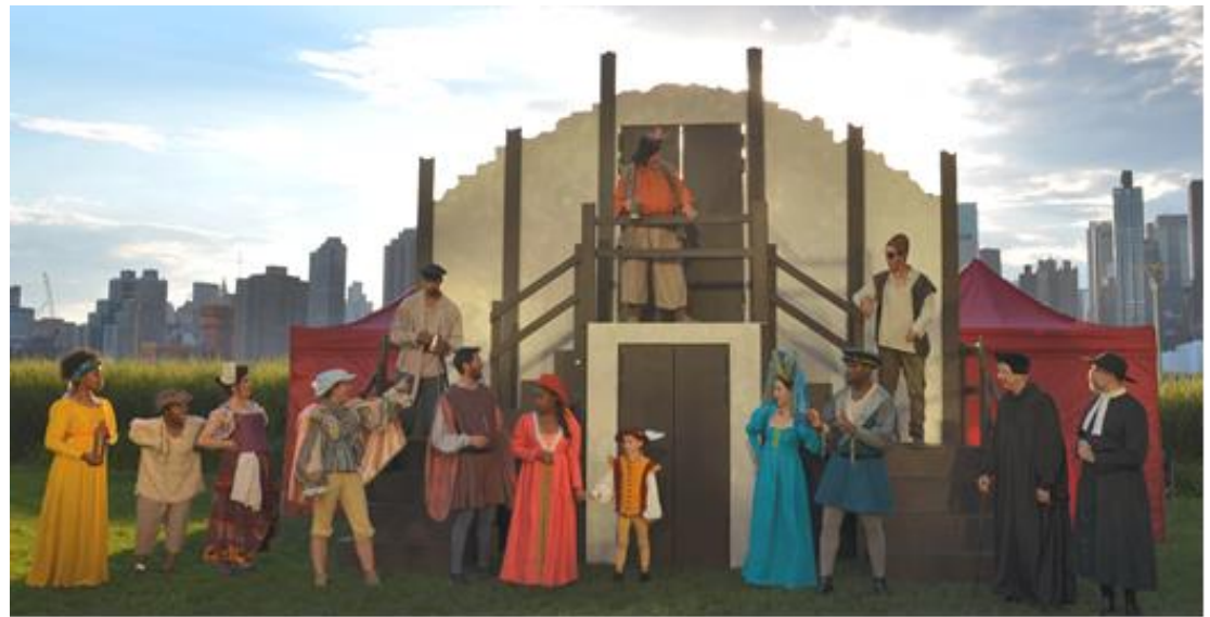
The Merry Wives of Windsor at Gantry Plaza State Park, 2015

Phone: 718-729-8567 Email: contact@hiptohip.org www.hiptohip.org